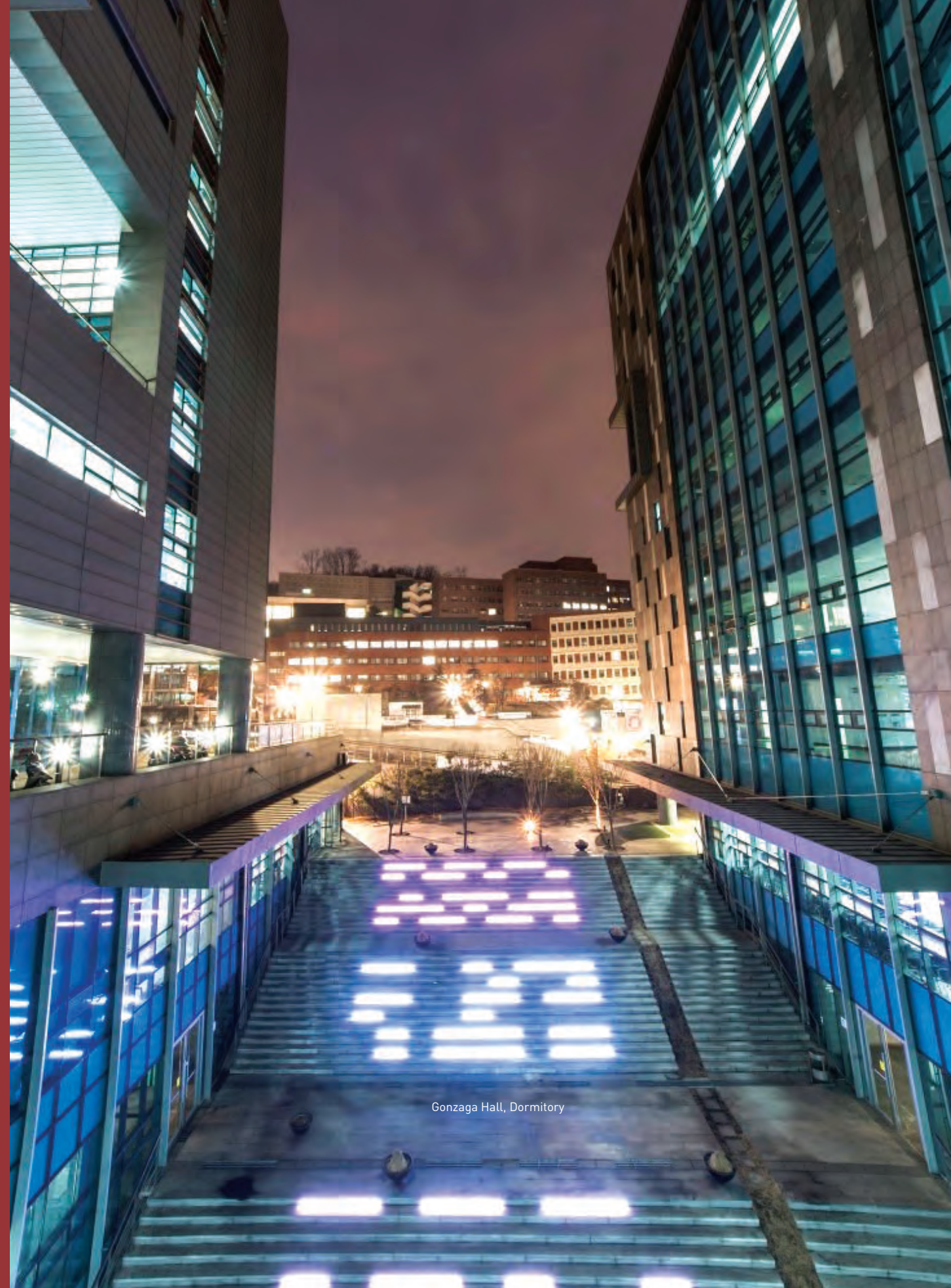
Gonzaga Hall, Dormitory

http://www.visitkorea.or.kr/ http://www.kf.or.kr/ http://www.korea.net/