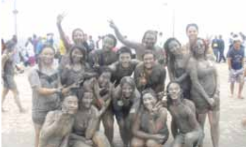
Boryeong Mud Festival