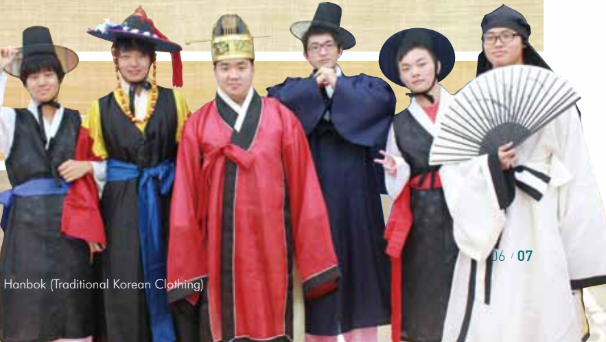
Hanbok (Traditional Korean Clothing)