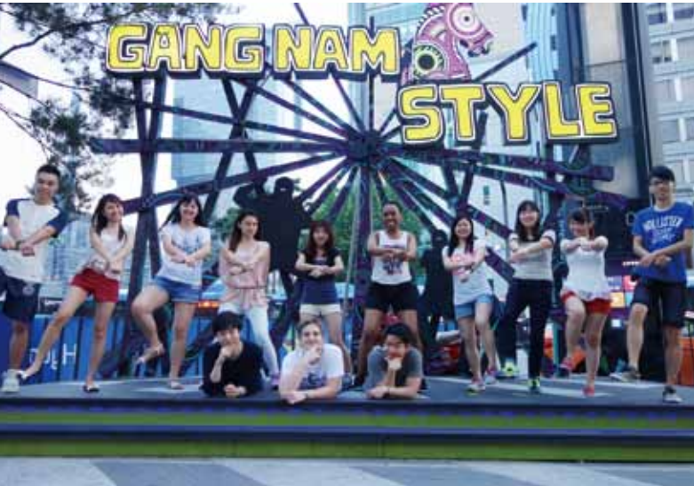
Seoul City Tour

A window into the history of Korea, the National Museum of Korea, the largest museum in Korea, displays 18,000 relics proudly exhibiting not only Korean cultural properties but also works of art from across Asia.