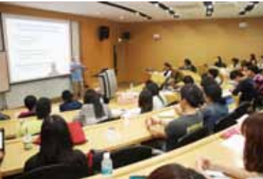
Class "Precarious Work and the Challenge for Asia"