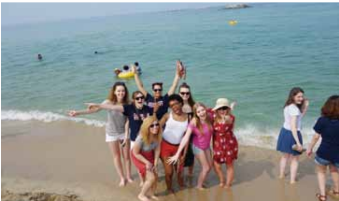
Field Trip to Gangwon-do