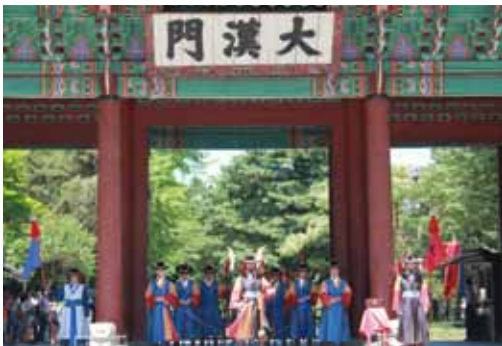
The Royal Place